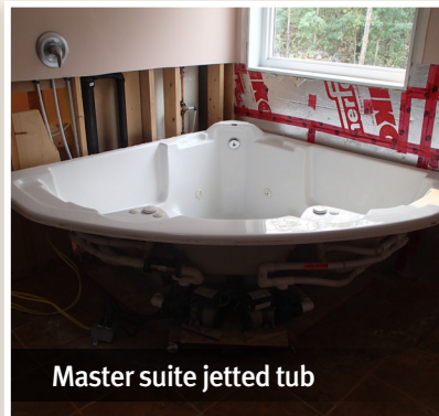
Master suite jetted tub