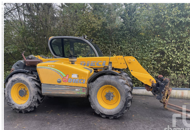
DIECI AGRIPUS 40.7