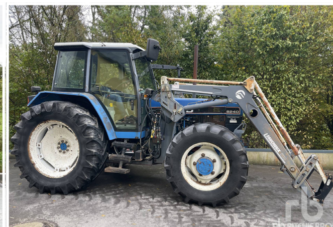
NEW HOLLAND 8240