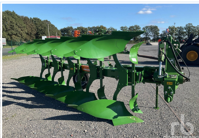
2018 AMAZONE CAYRON 200 V5-1 (Unused)