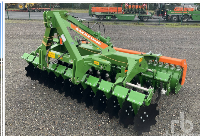
2023 AMAZONE CATROS 3001+ (Unused)