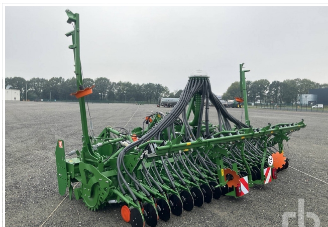
2023 AMAZONE KG 5001-2