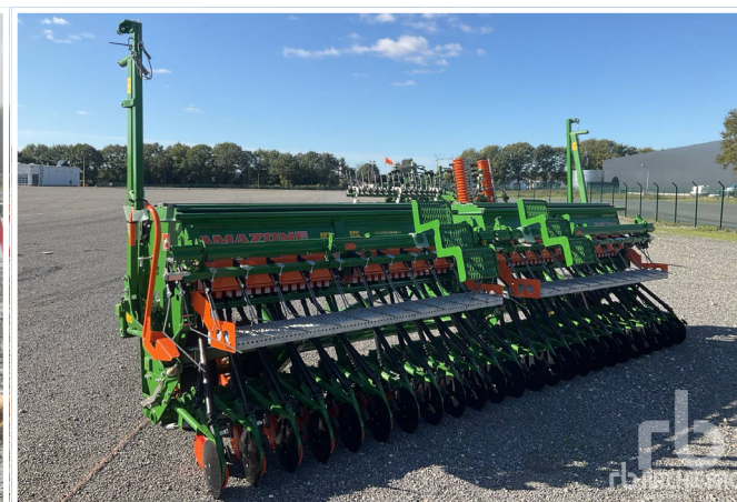
2023 AMAZONE D9-60 SUPER (Unused)