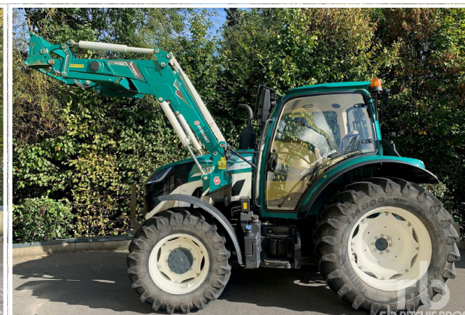
2019 ARBOS P5100