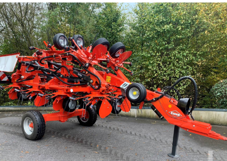
2019 KUHN GF 13012 (Unused)