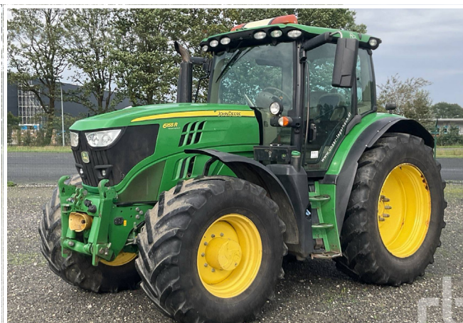
2017 JOHN DEERE 6155R