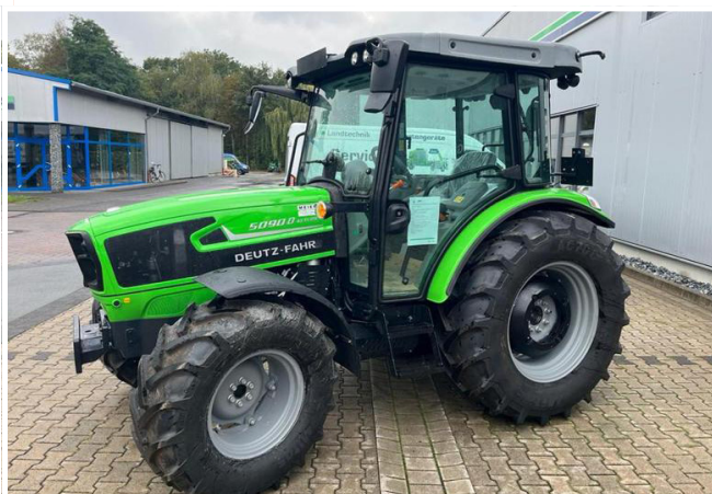
2022 DEUTZ-FAHR 5090 D KEYLINE (Unused)

Need a loan for your machinery? We're here for you!