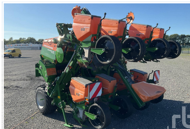
2020 AMAZONE ED6000-2C