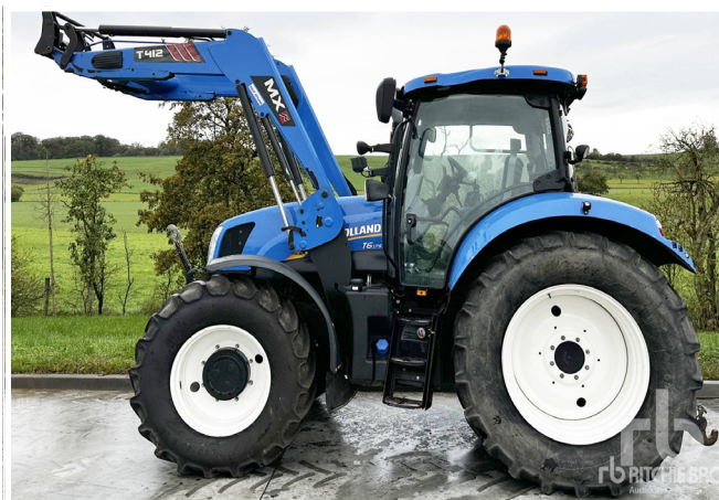
2016 NEW HOLLAND T6.175