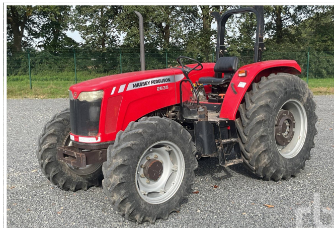
TAFE MF 2635