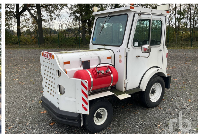
1/3 - TUG MA50-4.2 4x2