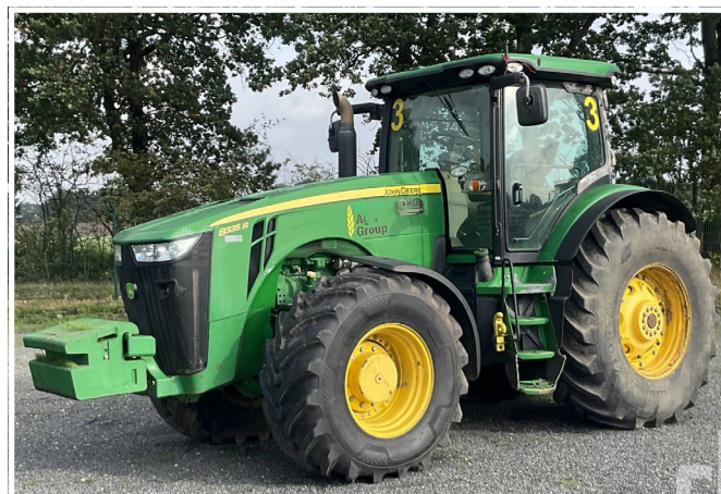
2014 JOHN DEERE 8335R