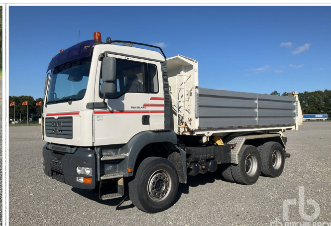
MAN TGA 26.440 6X4