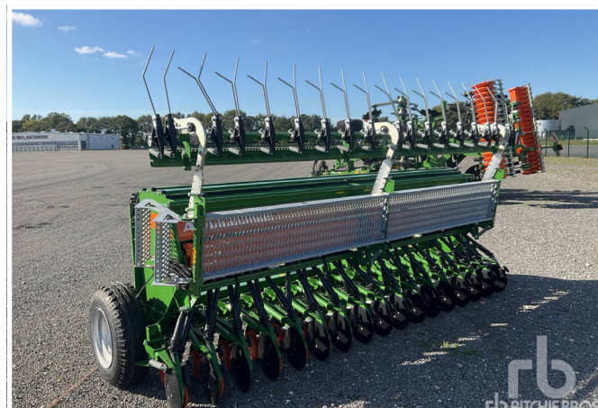
2022 AMAZONE D9 4000 SUPER (Unused)