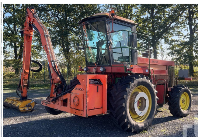
JOHN DEERE 5720 Flail Mower