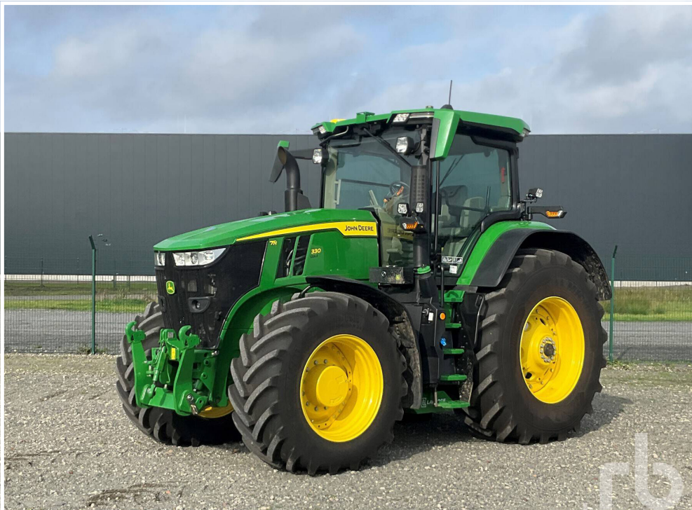
2022 JOHN DEERE 7R 330 Gen 2