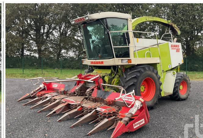
CLAAS JAGUAR 860 4WD