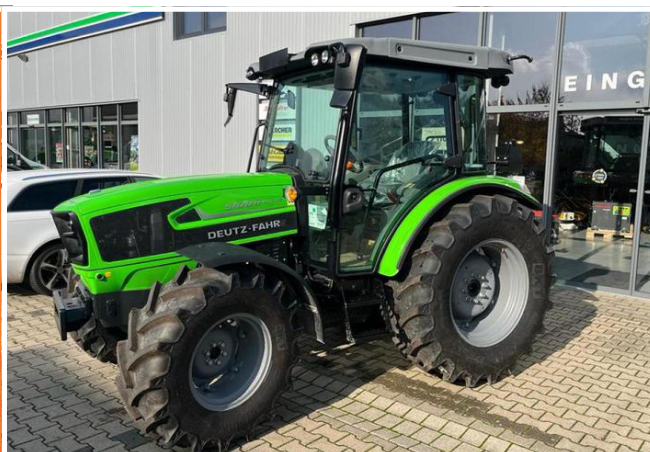
2022 DEUTZ-FAHR 5100 D KEYLINE (Unused)