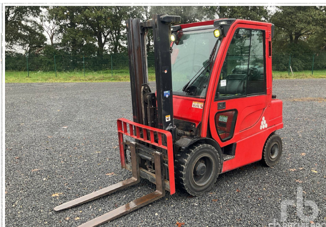
2015 HYSTER H2.5FT