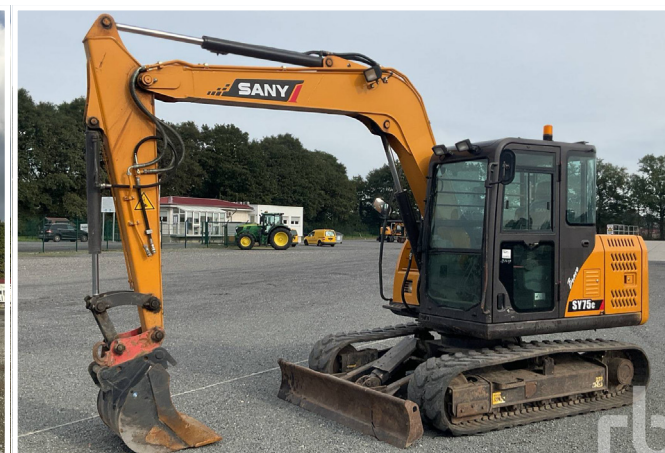
2015 SANY SY75C