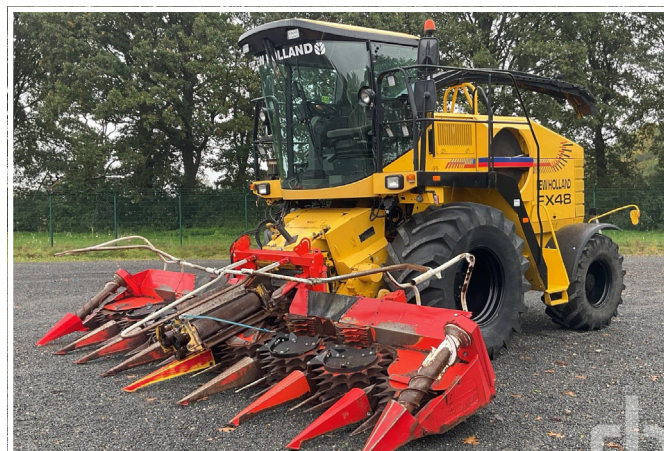
NEW HOLLAND FX48 4WD