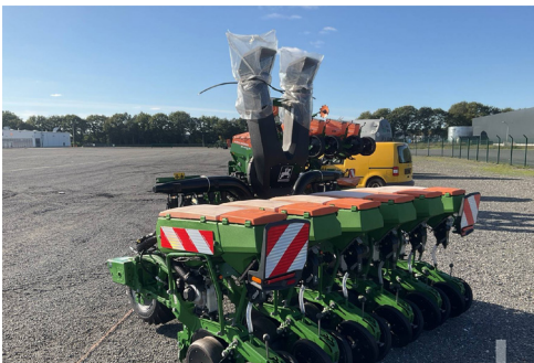
2023 AMAZONE PRECEA 4500-2 S (Unused)