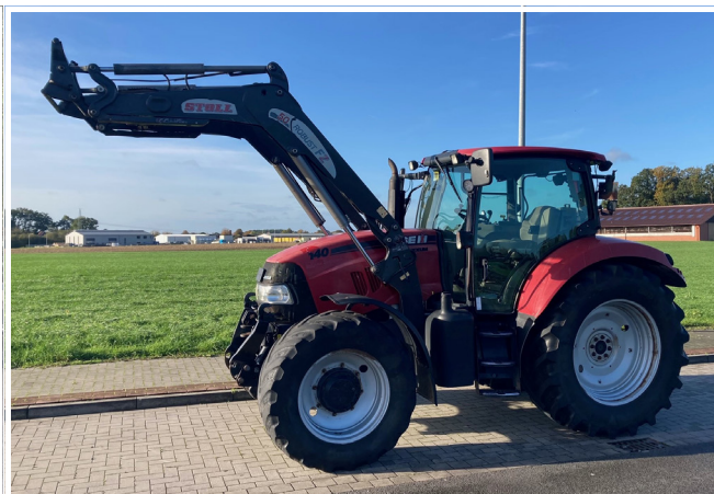
Case IH Maxxum 140