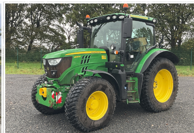
2017 JOHN DEERE 6120R