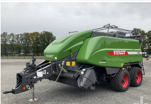
2020 FENDT 1290 S (Unused)