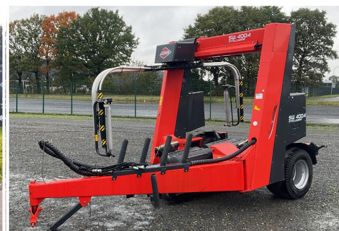
2013 Kuhn SW 4004