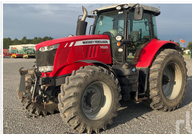
2014 MASSEY FERGUSON 7626 Dyna-6