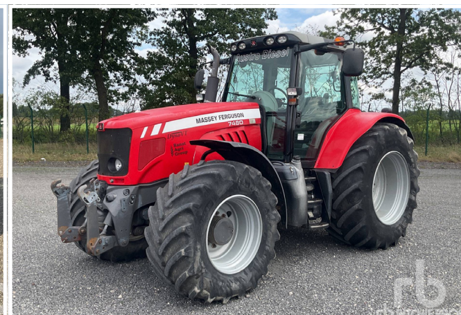
1/2 - MASSEY FERGUSON 7480 Dyna-VT