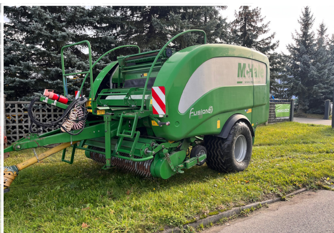
2013 MCHALE FUSION 3