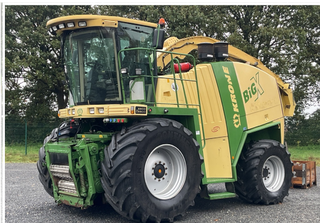
Krone Big X 650 4WD