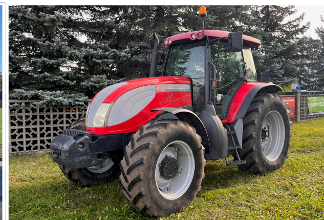
McCORMICK G-MAX 135