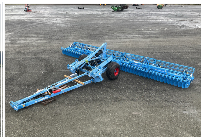
LEMKEN HELIODOR GIGANT 12/1200