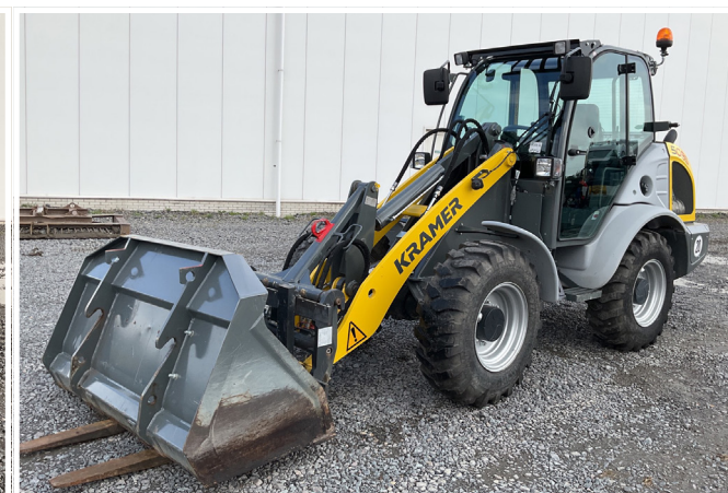
2022 Kramer 5085