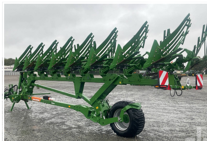
2019 AMAZONE HEKTOR 1000 SRH82