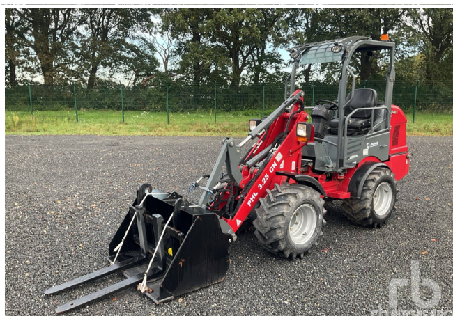
2022 TAIAN DY35 (Unused)