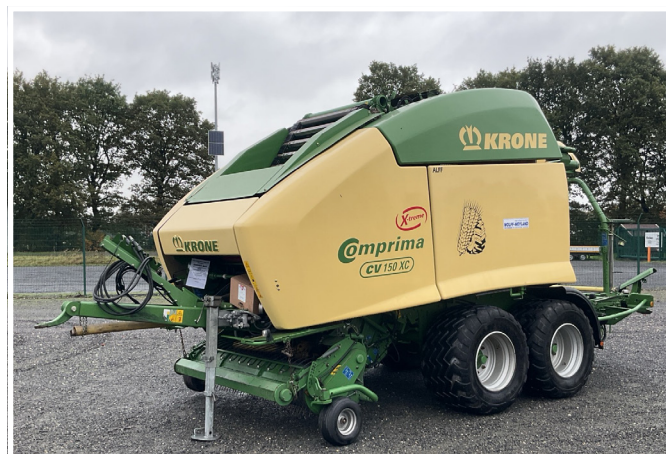
2016 KRONE COMPRIMA CV150X