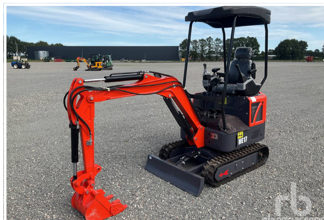
Qty of 2023 PLUS POWER HE17 (Unused)