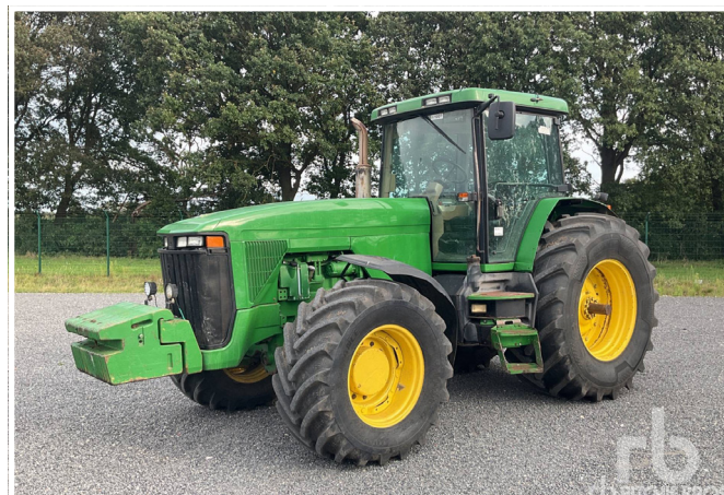
1/2 - JOHN DEERE 8300