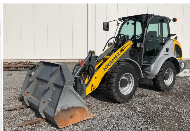
2022 Kramer 5095