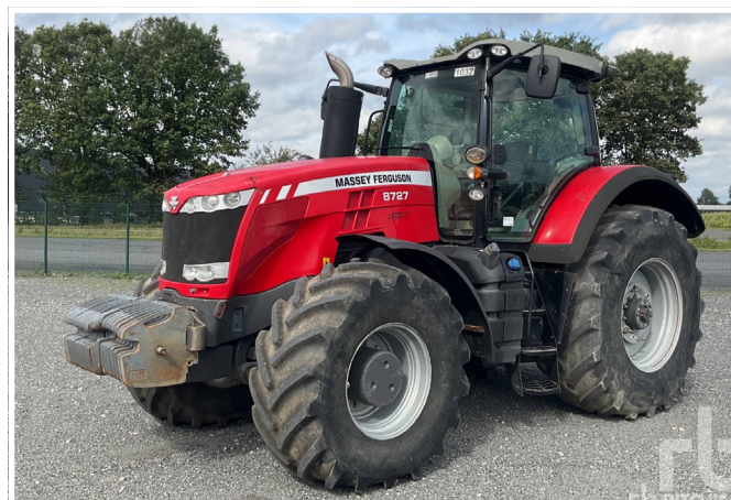
2015 MASSEY FERGUSON 8727 Dyna-VT