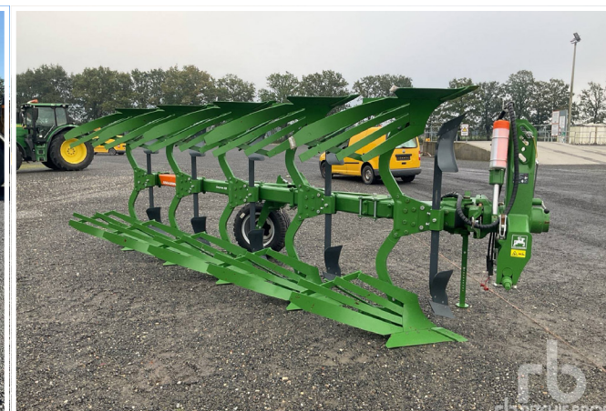
2020 AMAZONE CAYROS XS 1150 (Unused)