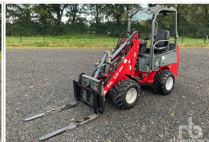
2022 TAIAN DY25 (Unused)