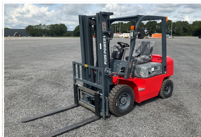
Qty of 2023 PLUS POWER VTDD-25 (Unused)