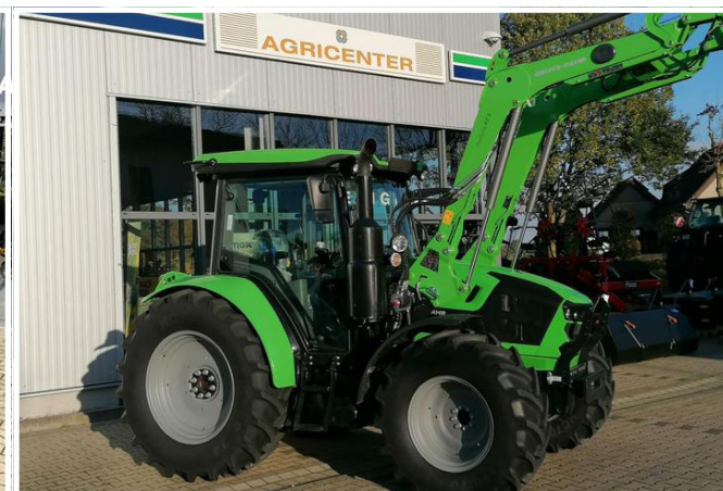
2022 DEUTZ-FAHR 5100 GS

Need a loan for your machinery? We're here for you!