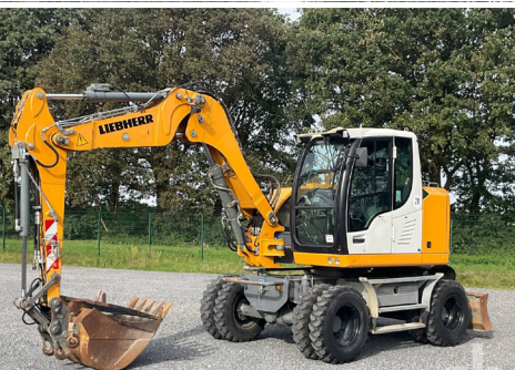
2014 LIEBHERR A910 COMPACT