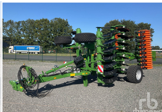
2020 AMAZONE CERTOS 5002-2TX (Unused)