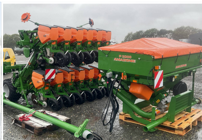
2019 AMAZONE ED6000-2FC