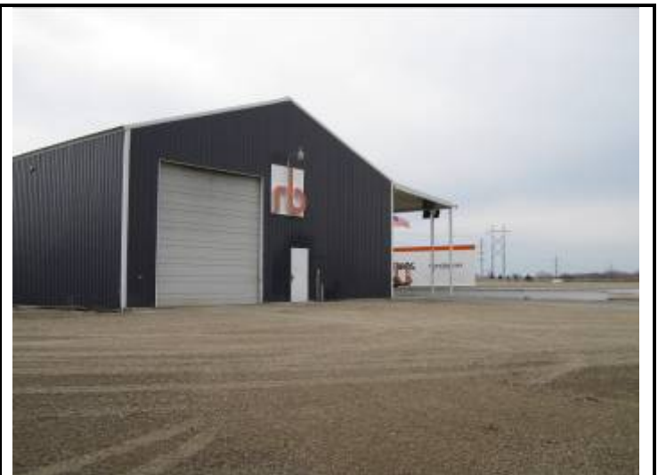
5. View of the former generator pad located on the north side of the site building.