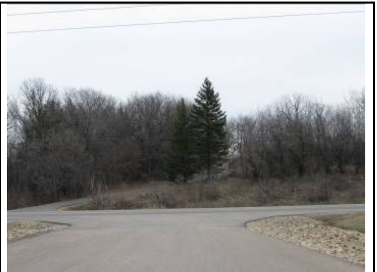
28. Adjacent east of the site.