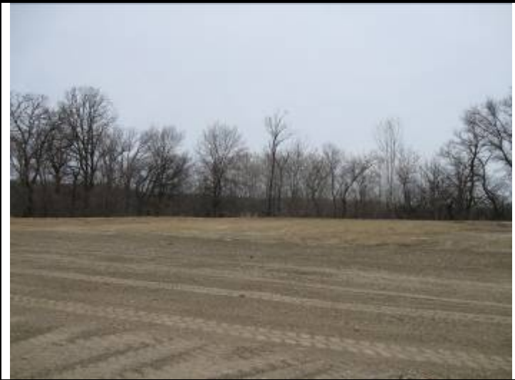
25. View of the former building location.