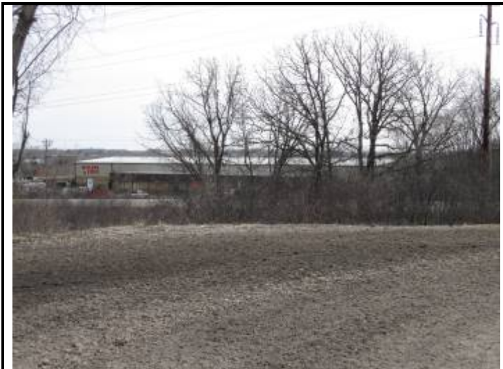
27. Adjacent northeast of the site.