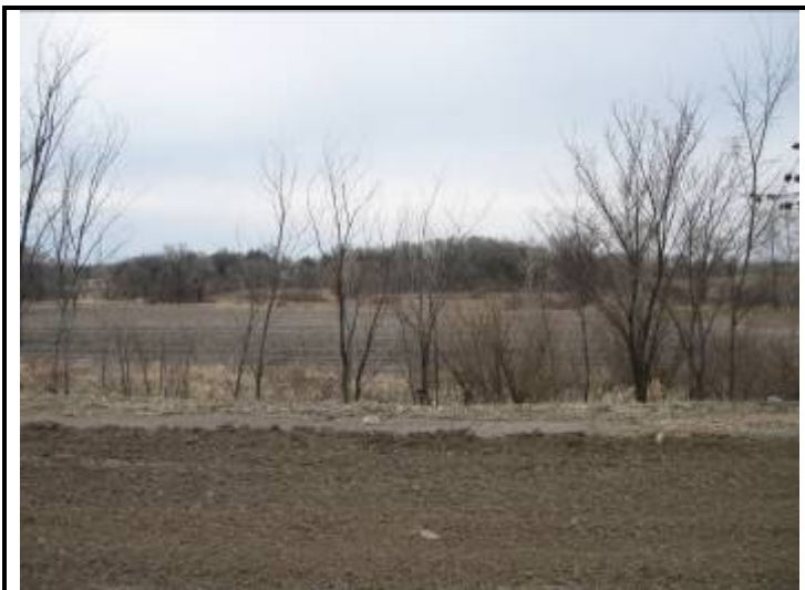
29. Adjacent south of the site