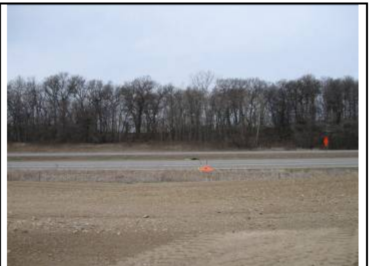
30. Adjacent west of the site.