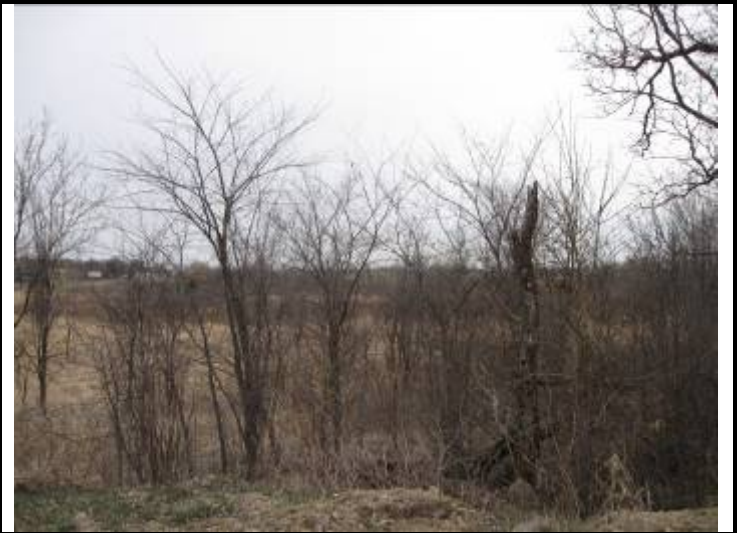
26. Adjacent north of the site.