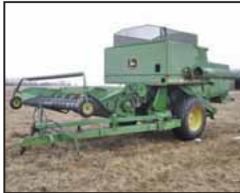
JOHN DEERE 6601