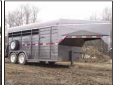
BERGEN T/A GOOSENECK