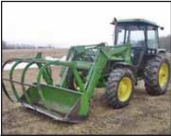
JOHN DEERE 2555 MFWD