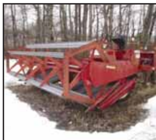
MASSEY FERGUSON 655