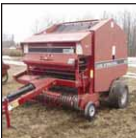
CASE IH 8480 ROUND

6 Ft Steel Swath Roller * (2) 5 HP Rototillers * High Hog tipping table * Payson cattle squeeze * (3) Rubbermate cattle feeders troughs * Tomstone round bale feeder * 100 gal slip tank w/elec pump * (2) 50 gal slip tanks * 16 In. Western Saddle * 2 wheel trailer, for quad * (3) 300 gal fuel tanks on wood stand * (3) rolls of game fence * 1200 gal poly tank * (2) 100 bu self * (2) gas weed eaters, one unused * table saw * tow rope * ladders * STIHL chain saw * chains * hand tools * 5 hp gas water pump * 1750 w gas gen set * 2 ton floor jack * 1/2 in. drill * 1/4 in. drill * come along * 9 in. hyd post hole auger, mounts on ldr * chain boomers * old buck saw * hay knife * scythe * bolt bin w/bolts * Magna Force * portable air compressor * bench grinder * 180 amp welder * vise * side grinder * air tank * cement mixer * HOUSEHOLD * wood table w/(4) chairs & matching china cabinet * (2) chester field sets * (2) TV's * (2) bedrooms sets, bed & dresser * TV stand * (2) deep freezers * (2) fridges * washer * spin dryer