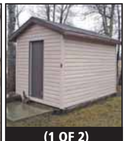
(1 OF 2) GARDEN SHEDS