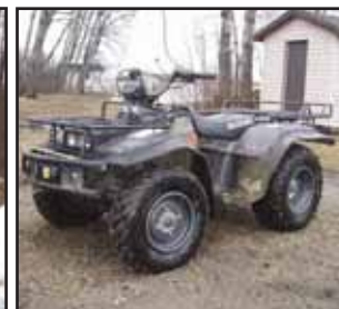
SUZUKI 300 4X4