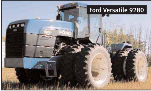
Ford Versatile 9280